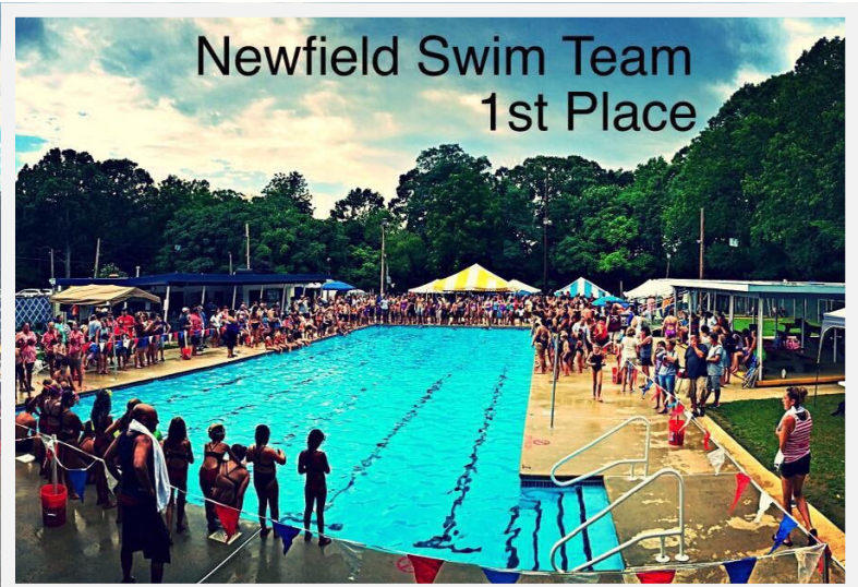
Newfield Barracudas 2016 Champions - July 30 th , 2016